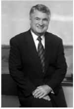
Russell MacLellan 24 th Premier of Nova Scotia Senior Counsel, Wickwire Holm Phone: 902.482.7014 Email: rmaclellan@wickwireholm.com

With his vast experience at both the provincial and federal government levels, and his proven track record in public consultation and consensus-building, Russell brings a unique array of experience to the firm. An accomplished TaeKwon Do Black Belt, the former Nova Scotia Premier served as executive assistant to the president of the Cape Breton Development Corporation and as legal counsel and assistant secretary for the Sydney Steel Corporation before re-entering private law practice in Sydney in 1973.